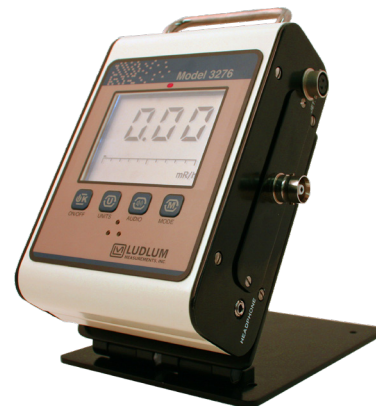
Model 3276 with desktop stand option